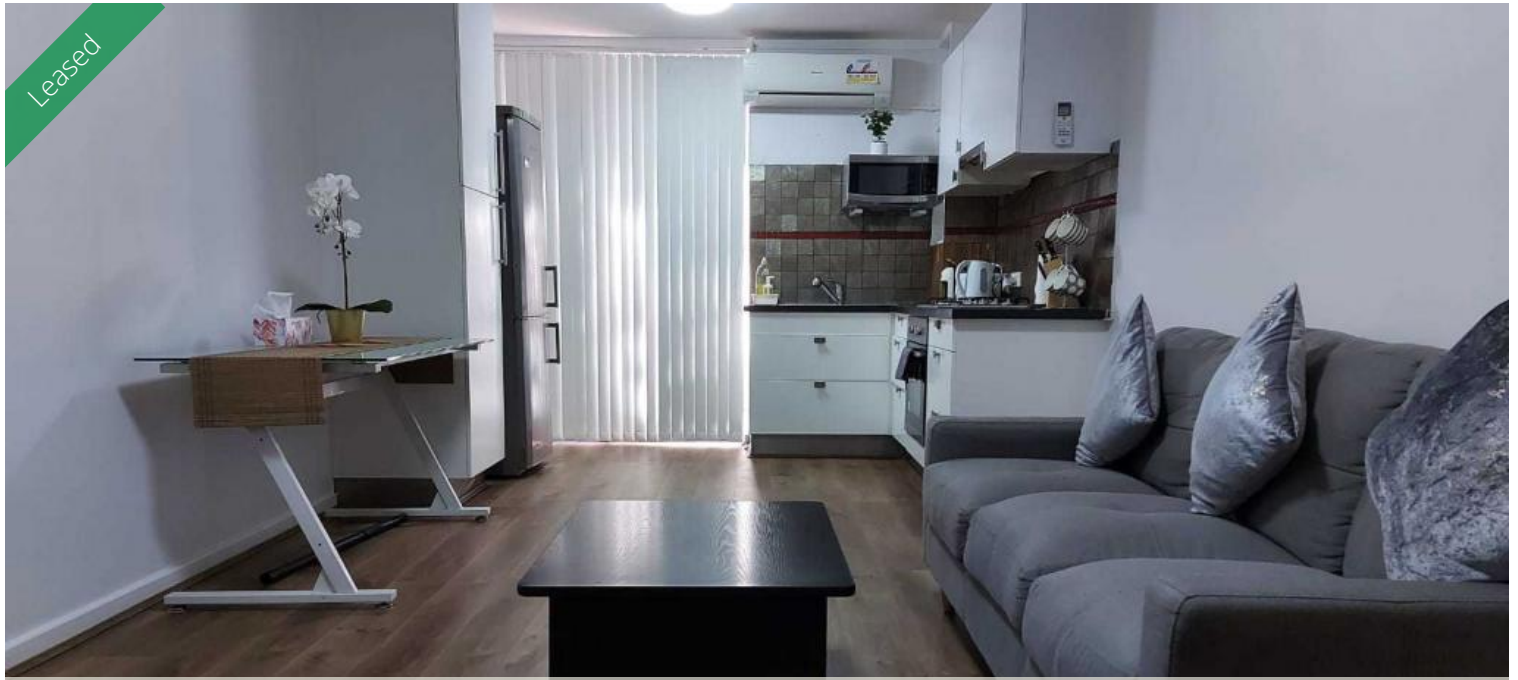
Unit 2, 36 Tenth Ave, Maylands